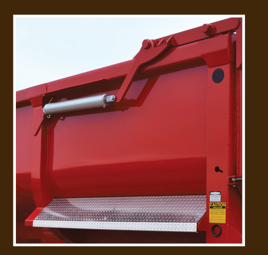
Double Hinge Tailgate Allows for hi-lift or free-flow action of tailgate.

Spreader Apron Allows for more even spread of material during dump cycle.